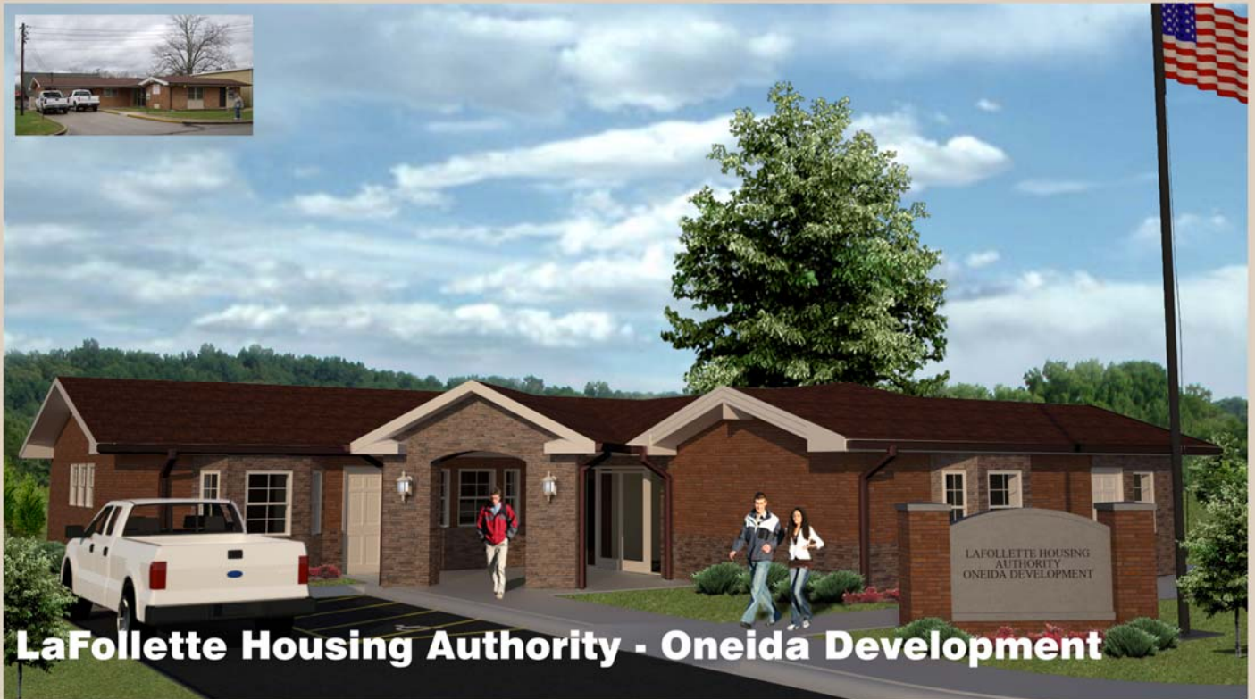
LaFollette Housing Authority - Oneida Development